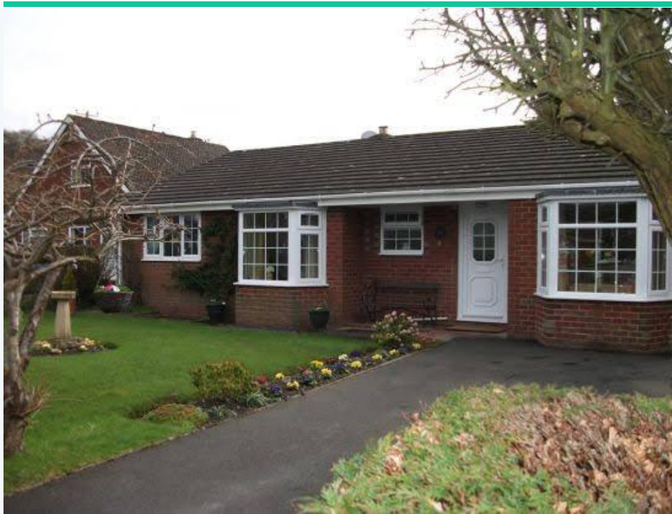
Hideaway, Bowood Lane, Wendover, HP22 6QB