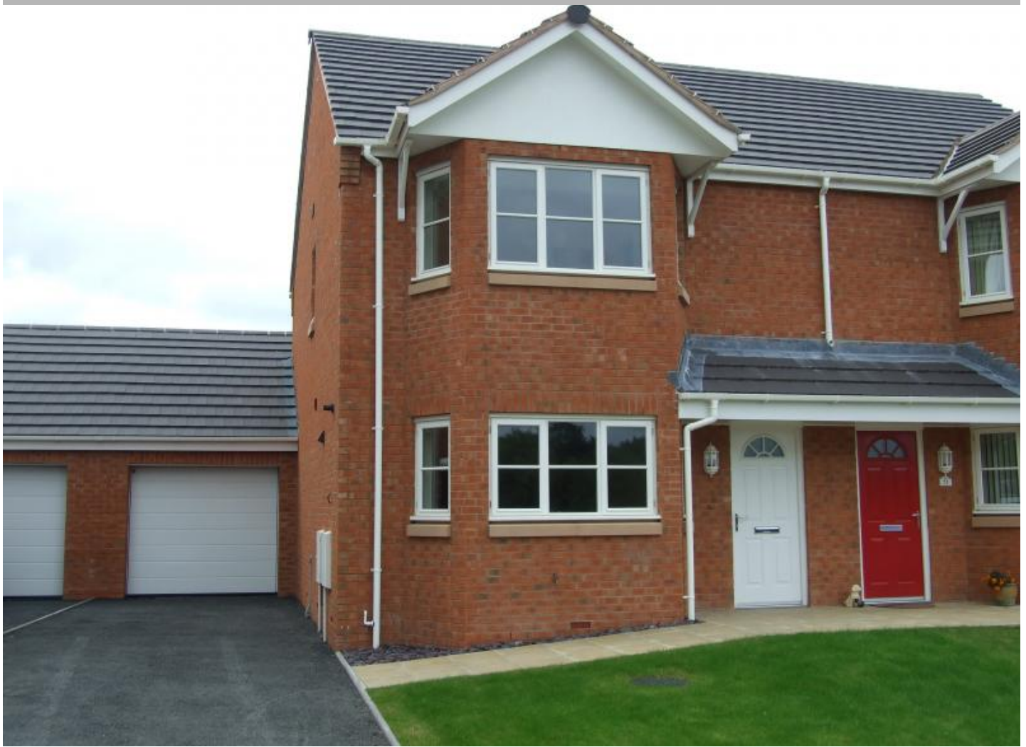
Front of Property 10/01/2015 18:12:15

Completed By: Rachel Lightfoot / TouchRight Demo Account